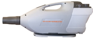
GO CLEAN GERMBUSTER® ULV Electrostatic Sprayer

Call: 469-217-7100 sales@buyerinteractive.com www.buyerinteractive.com