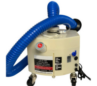
CK-Mini Machine with Wheels