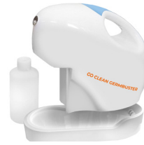
Go Germbuster Handheld