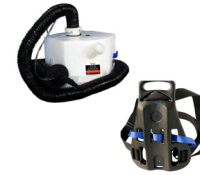
CK-Mini Machine with Backpack Package