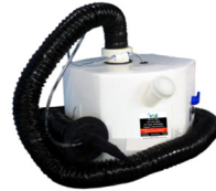
CK-Mini Machine Electrostatic Sprayer